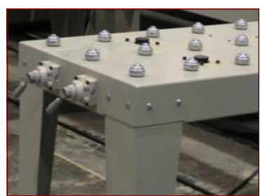
Handles control part location pins and spoil board stabilizer pads

Remote operator control station mounted on pedestal