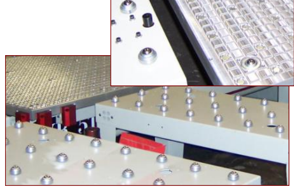
Roller ball table with pneumatic rolling balls for ease of spoil board transfer