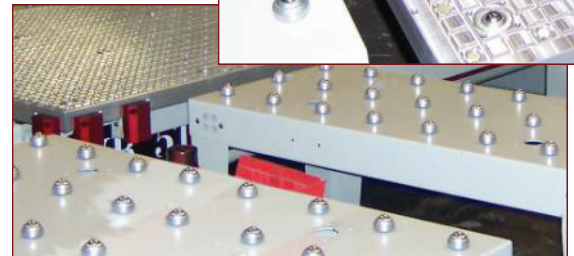
Roller ball table with pneumatic rolling balls for ease of spoil board transfer