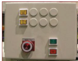
Remote operator control station mounted on pedestal